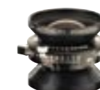
5.6/150 L + Copal 0