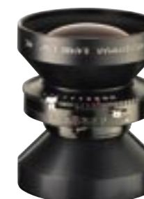
8.4/480 L + Copal 3