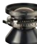
5.6/210 L + Copal 1