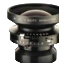
5.6/300 L + Copal 3