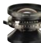
5.6/180 L + Copal 1